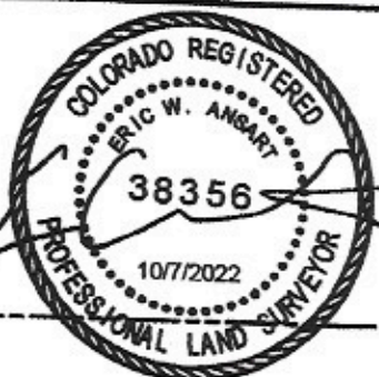
ILLUSTRATION FOR EXHIBIT A